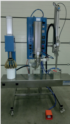
GemiFill S with sub-level filling lance and lid crimper.