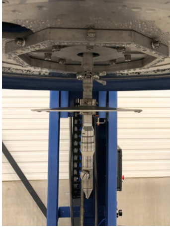
Rotary spray head.