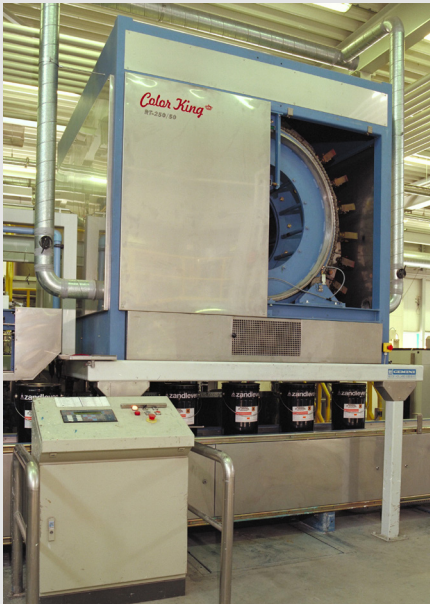
Elevated set-up in-can tinting.