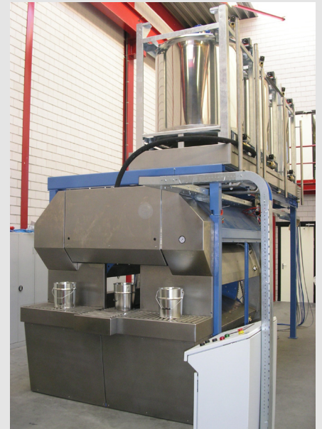
Non-elevated set-up for in-can tinting only.