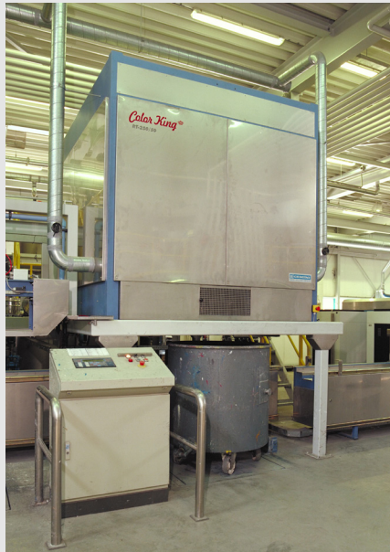
Elevated set-up batch dispensing.